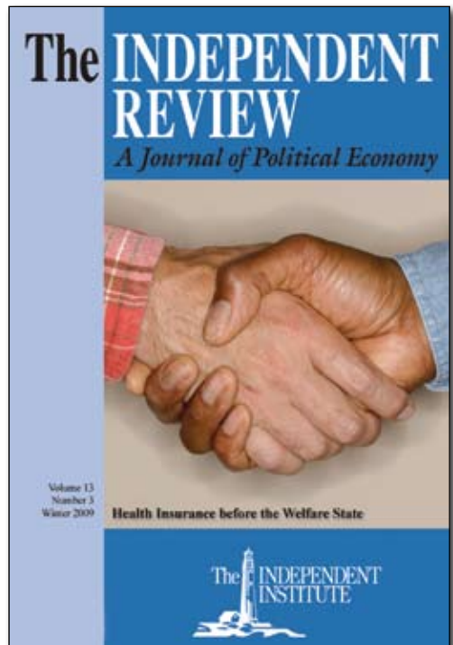
The Independent Review, Winter 2009

See www.independent.org/publications/tir/article.asp?a=713 .