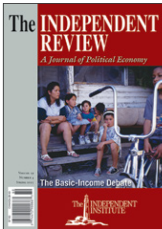
THE INDEPENDENT REVIEW SPRING 2015

The Independent Institute’s quarterly journal offers an exciting array of scholarship on political economy and intellectual history. Here are two highlights from the Spring 2015 issue.