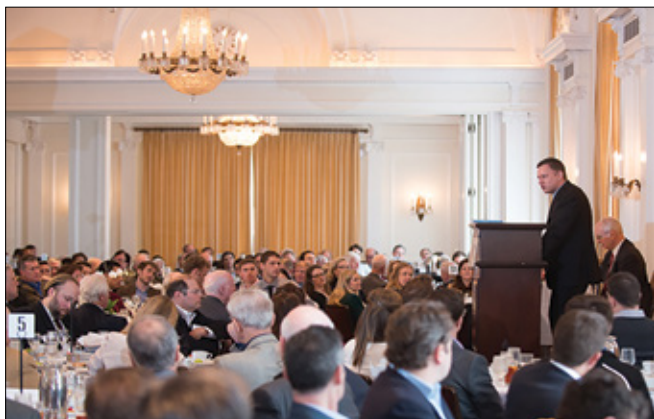
PETER THIEL CAPTIVATES ATTENDEES AT INDEPENDENT INSTITUTE EVENT

"The part that is dangerous about the California dynamic," Thiel said, "is that when you have these super-networked industries, it's possible that policy can go incredibly far wrong before anybody notices."