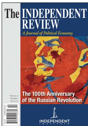
THE INDEPENDENT REVIEW FALL 2017