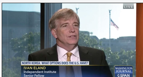
IVAN ELAND ON C-SPAN’S WASHINGTON JOURNAL, 8/9/17