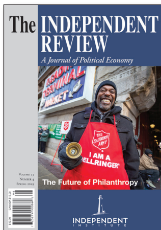
THE INDEPENDENT REVIEW SPRING 2019

Taking a different tack, poverty and welfare policy scholar Samuel P. Hammond (Niskanen Center) suggests that freedom's advocates generally overestimate