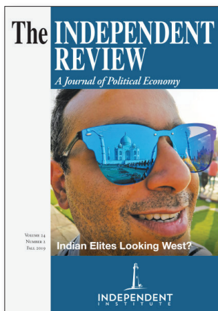
THE INDEPENDENT REVIEW FALL 2019