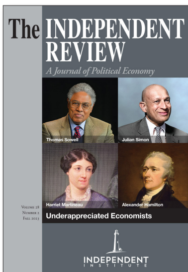
Learn about the most underappreciated economists—some you probably know, others you've likely never heard of!