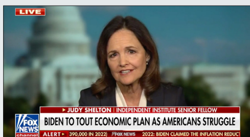
JUDY SHELTON ON THE FOX NEWS CHANNEL, 8/16/23

— Judy Shelton in The Wall Street Journal , 10/31/23