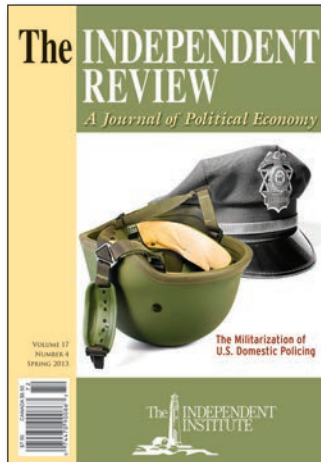
The Independent Review, Spring 2013

“Crony Capitalism: By-Product of Big Government,” by Randall G. Holcombe, is available at: http://www.independent.org/publications/tir/article.asp?a=927 •