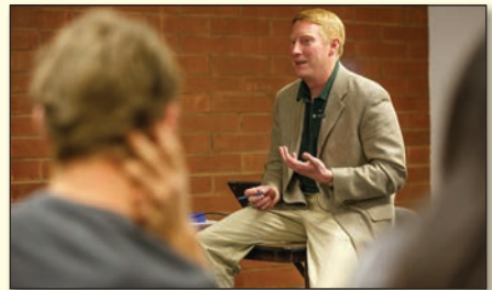
Powell addressing students at Institute summer seminar

"Basic economic theory, advanced empirical research, and common sense all lead to the same conclusion: minimum wage mandates hurt the very people they are intended to help. Unfortunately, good economics doesn't always coincide with good politics. So economists are doomed to fight this same battle over and over again, each time a politician finds it politically expedient to peddle some minimum wage economic illiteracy." http://www.independent.org/newsroom/article.asp?id=3559 •