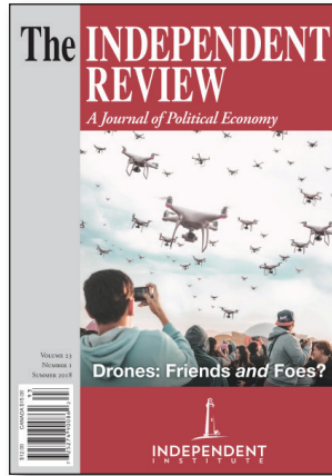
THE INDEPENDENT REVIEW SUMMER 2018

A sky crowded with UAVs, many rushing to deliver that extra-large cheese pizza for the