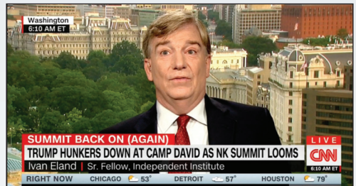
SENIOR FELLOW IVAN ELAND ON CNN, 6/2/18