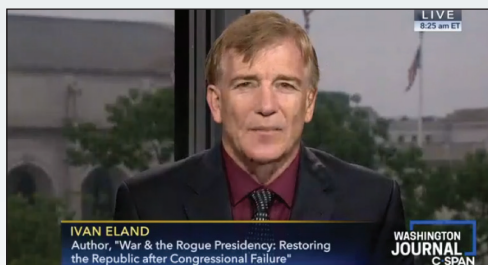
SR. FELLOW IVAN ELAND ON C-SPAN’S WASHINGTON JOURNAL 5/28/19

— Ivan Eland on C-SPAN’s Washington Journal , 5/28/19