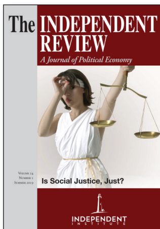
THE INDEPENDENT REVIEW SUMMER 2019

To be sure, classical liberals have landed heavy blows on standard conceptions of social justice. These criticisms, however, should not dissuade them from advocating the elimination of certain group differences, such